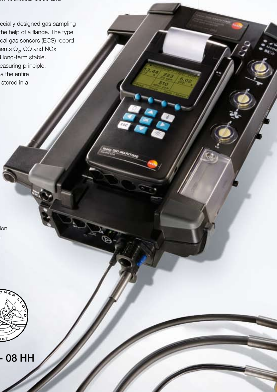
Exhaust gas analyzer testo 350-MARITIME