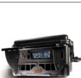
Anschlüsse im Koffer integriert